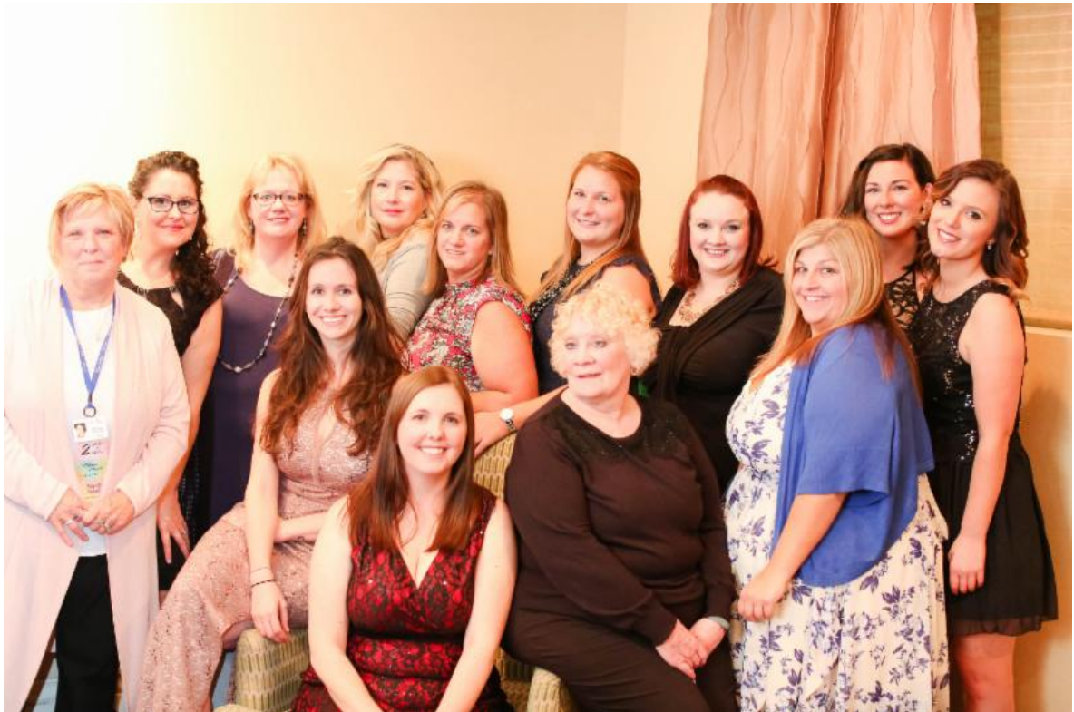
The Moms In Motion Admin Team!