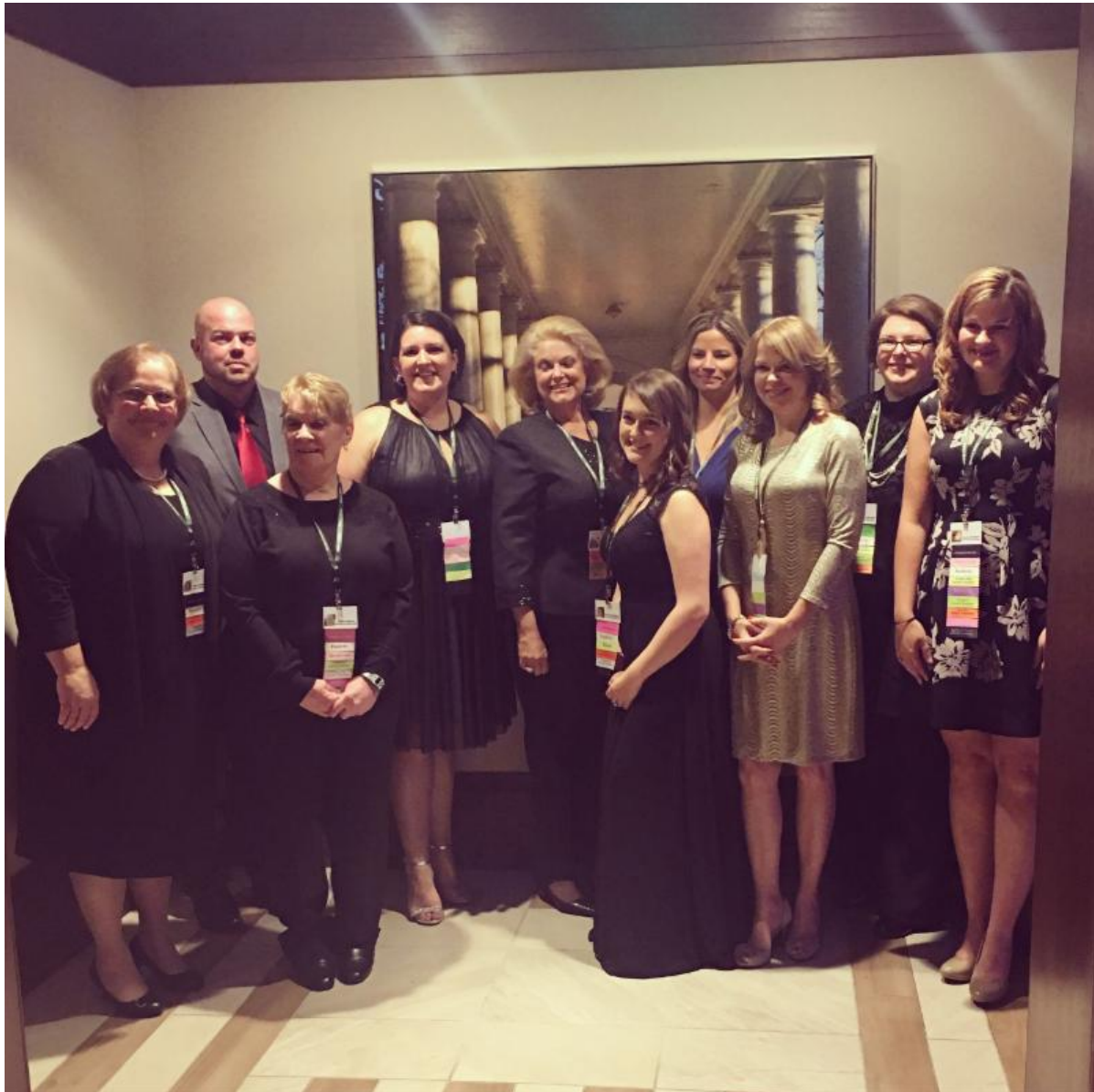
The Moms' Leadership Team at our 2016 Whole Team Retreat