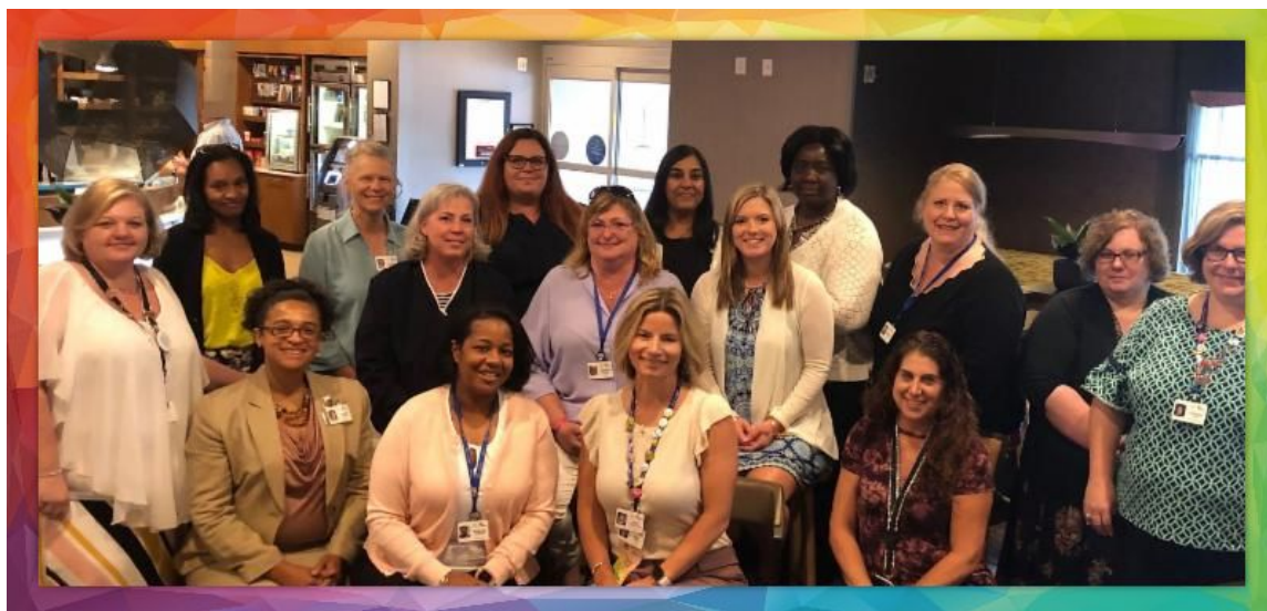
Northeast Team Meeting These Ladies Rock!